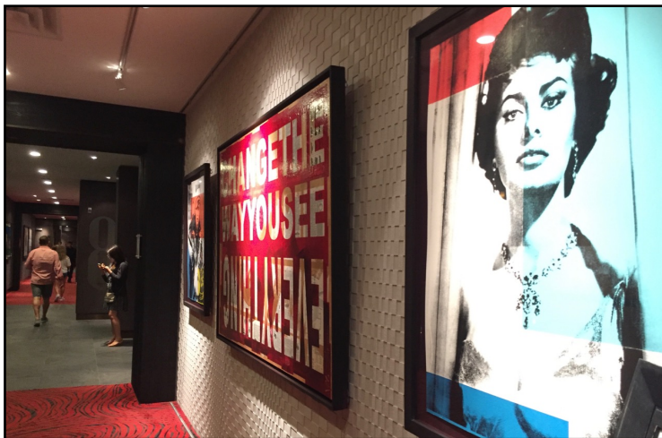
The iPic Theater is decorated with a variety of movie-related artwork.

The movie lineup includes first-run films of all types and is updated on a weekly basis. Screening rooms range in size from 38 seats to over 100. The theater boasts a variety of luxurious seating options as well as at-your-seat food service in certain areas. The menu includes items like Thai coconut shrimp for $15, pizzas starting at $14, and truffle fries for $9. Popcorn is available in one size only and costs $6, free refills included. A wide variety of drinks is also on offer, including beer