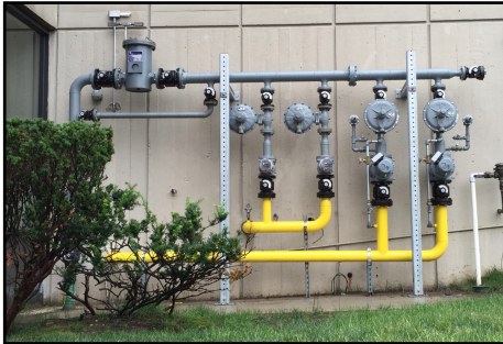
New gas metering equipment outside Building 2.