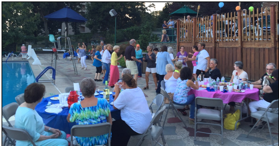
Horizon House residents and guests shakin' it up at the Goodbye to Summer pizza party.